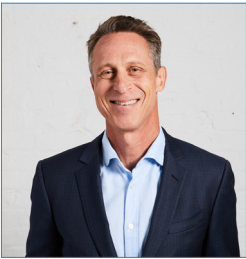
Dr. Mark Hyman, MD, Functional Medicine Doctor

"I have found infrared saunas to be very effective in reducing the stress response and creating balance in the autonomic nervous system. They can improve circulation, help with weight loss, balance blood sugar, and improve detoxification—each of which improves your brain function. I have personally benefited from Sunlighten sauna therapy and feel it can be integrated into anyone's wellness plan."